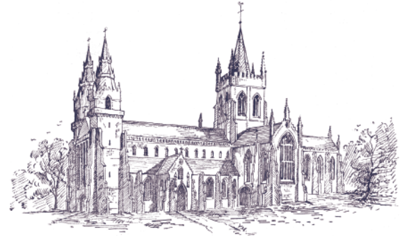
Artist's impression of St Machar's Cathedral in the 17th century

The Cathedral was named after a legendary disciple of Columba. Legend has it that Columba instructed his pupil to build a church near to where the river crooks like a bishop's staff. However the church here did not become a Cathedral until the 1100's when the seat of the Bishop was transferred from Mortlach (near Dufftown)