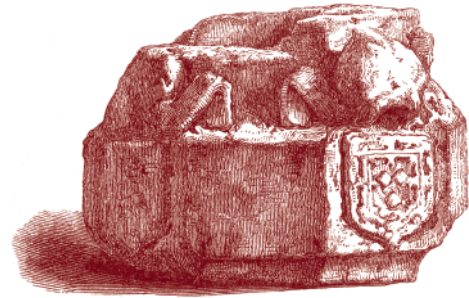
Fragment of Mercat Cross

In many ways the medieval mercat cross in Scotland was the centre of the burgh. Not only did it demarcate the area of the market but it was also the place from where proclamations and news were announced and where people were punished in a variety of different ways.