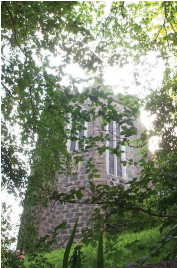
St Margaret's Convent Chapel