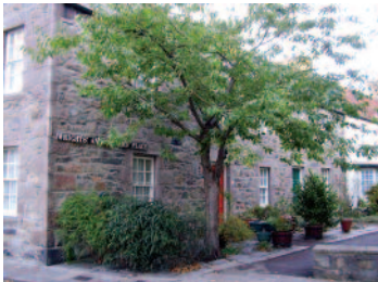
Wright's & Coopers' Place