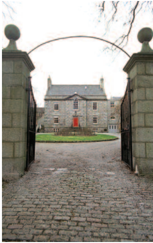
No 81 High Street

This building is the townhouse of the family of McLean of Coll. The foundation stone of the house was laid in 1771. The McLean family were prominent in local affairs, with Hugh McLean being chief magistrate in Old Aberdeen in the late 18th century. One of the actions taken under him was the construction of the fine Townhouse that we see today in Old Aberdeen. The wall in front of this building is made from Seaton bricks. These, used extensively in Old Aberdeen, were produced locally at the Seaton Brick and Tile works, which was located a little to the south of the mouth of the river Don.