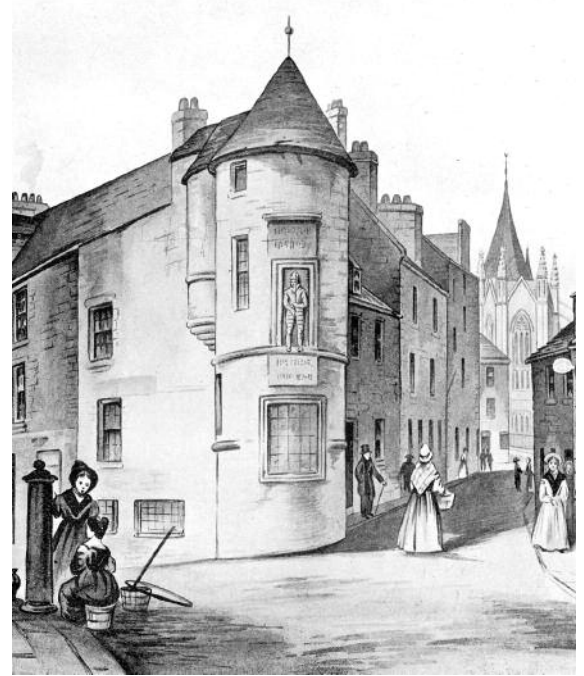
Benholm's Lodge at its original location