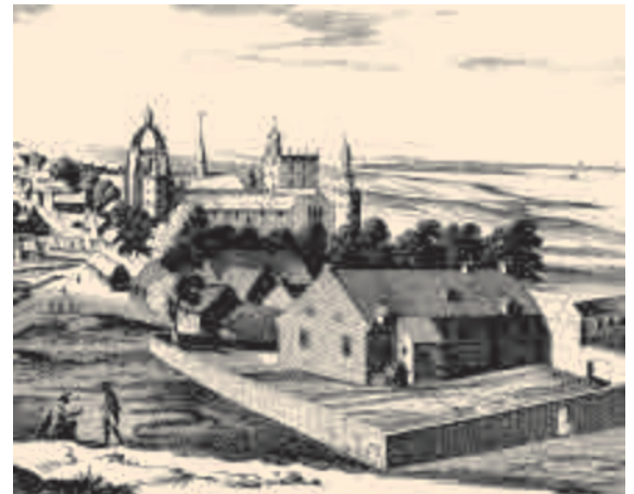
Snow Kirk in 1693