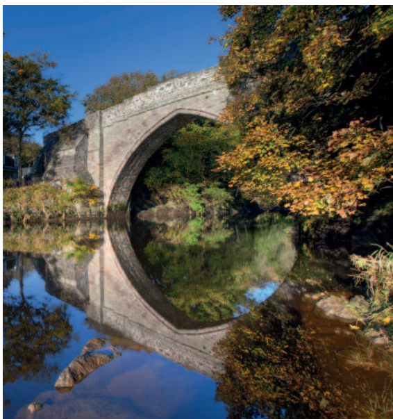
Brig o' Balgownie

Right: Old Aberdeen from Parson Gordon's map of 1661.