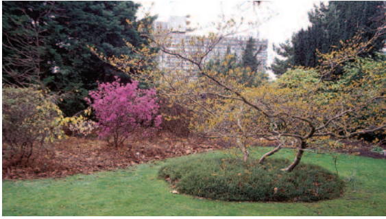
Cruickshank Botanical Garden